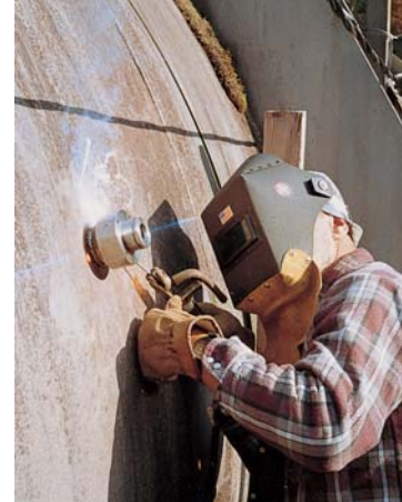
Hot-tap transducer installation