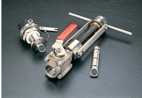
Model 7601 / 7641 fully removable transducer assembly with jacking mechanism