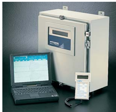
Model 7510 flowmeter in NEMA 4 enclosure