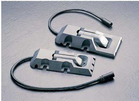
Model 7657 / 7658 intrinsically safe transducer