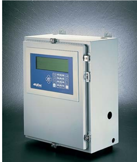
Model 7500 flowmeter in NEMA 4 enclosure