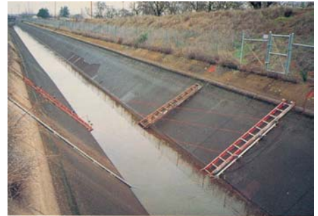
Open channel transducer arrangement